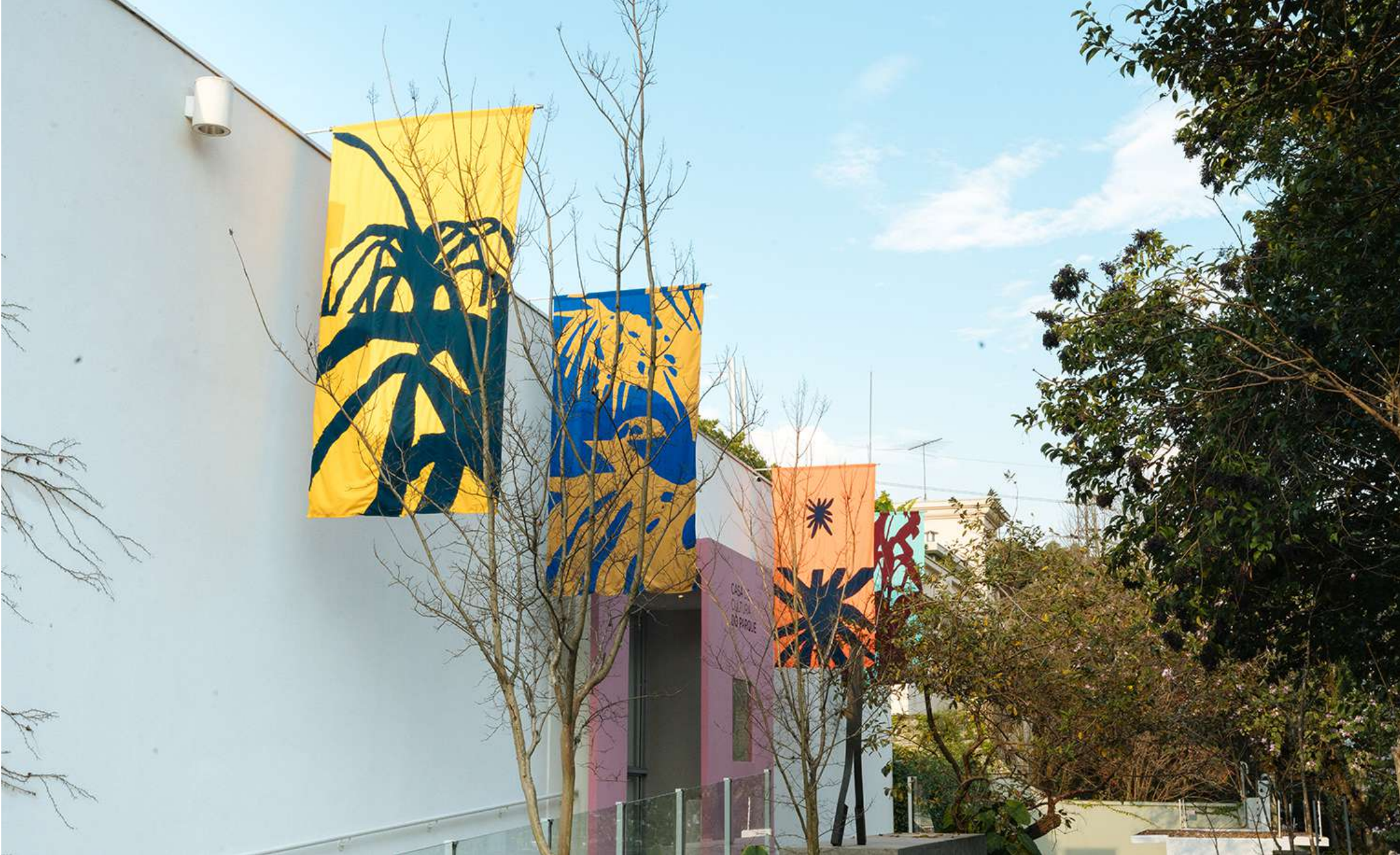
Solo show view: In n Out Aug 2023 - Casa de Cultura do Parque. São Paulo SP, Brazil.