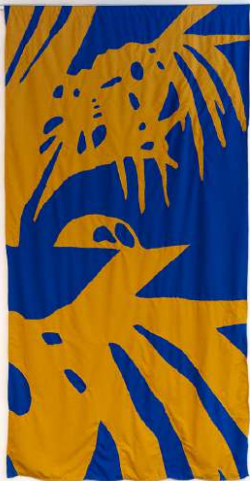
In n out II, 2023 Flag. 62x102"