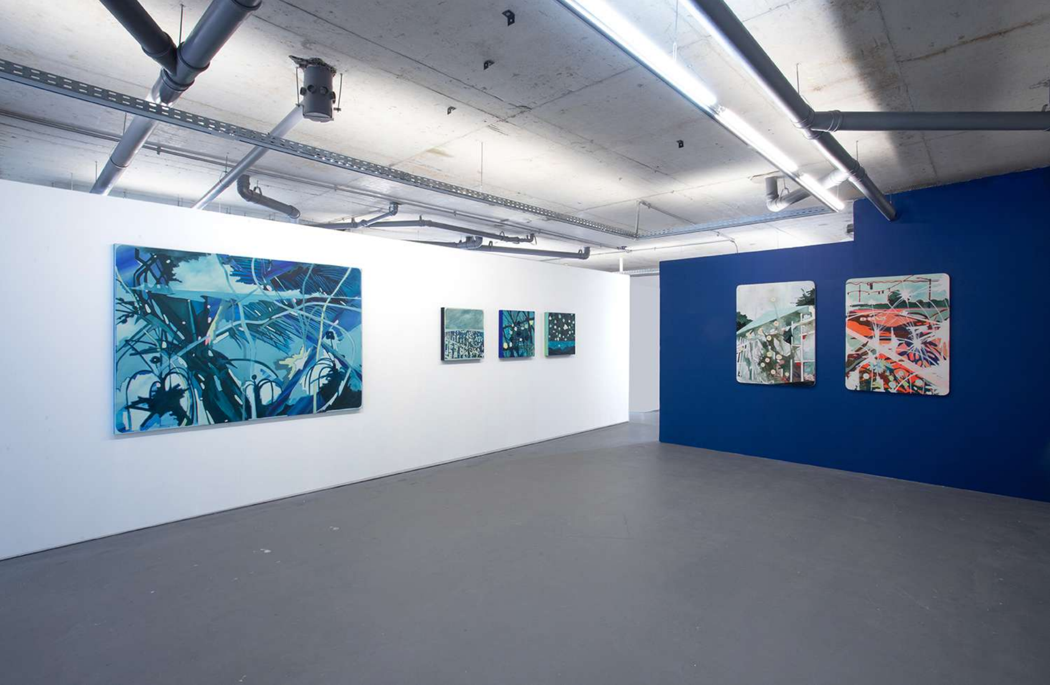
Solo show view - Space Between : Part II. 2026 Apr - OMA Galeria. São Paulo - SP, Brazil.