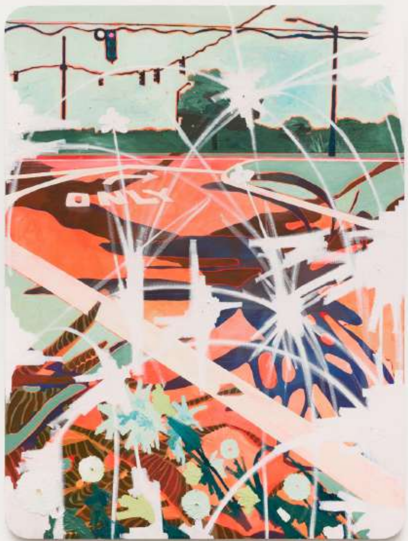
Metalandscape number XXXIII, 2022 - 2025 Oil on canvas. 47"x35"