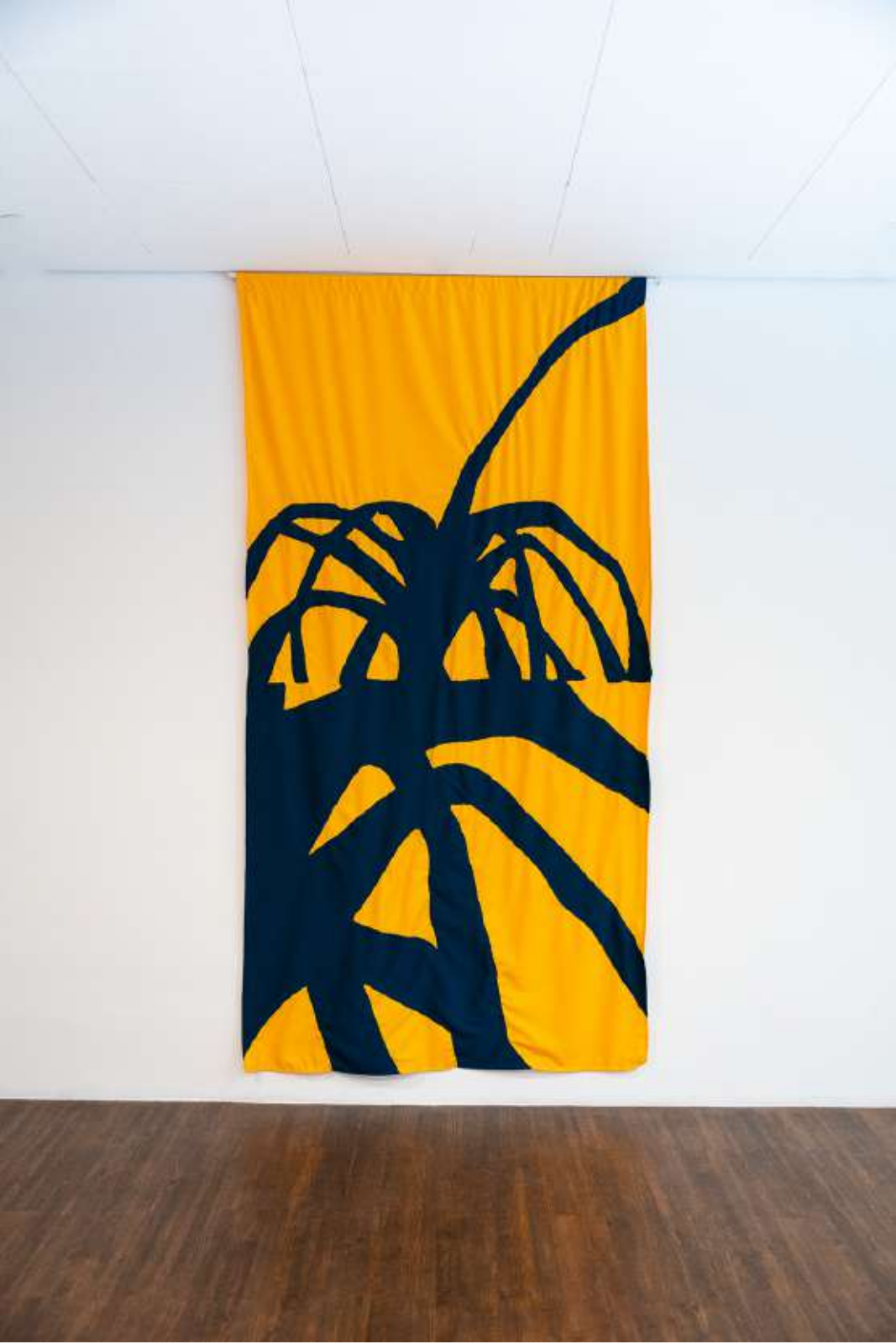
In n out I, 2023 Flag. 62x102"