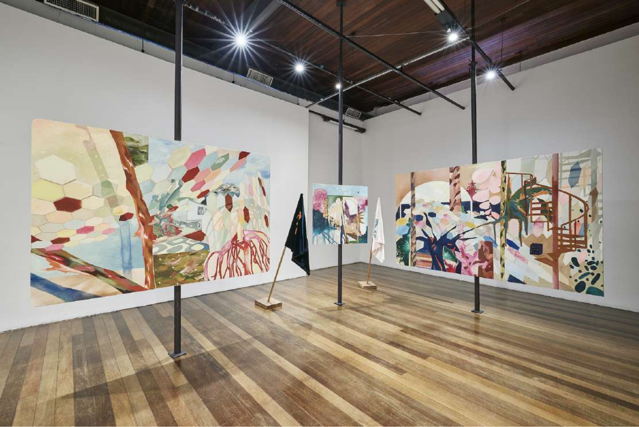
Solo show view: Space Between 2024 Sep - Centro Cultural dos Correios. Rio de Janeiro RJ, Brazil.