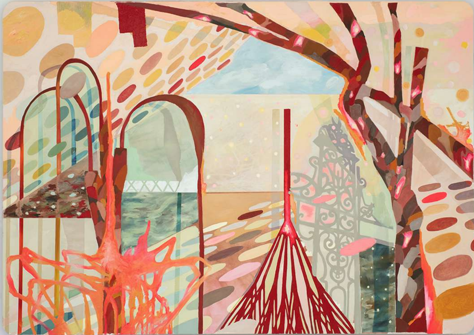
Metalandscape number XVII, 2024. Oil on canvas. 55"x78"