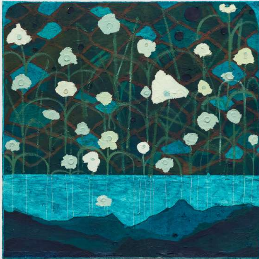
Metalandscape number XXIX, 2025. Oil on canvas. 23"x23"