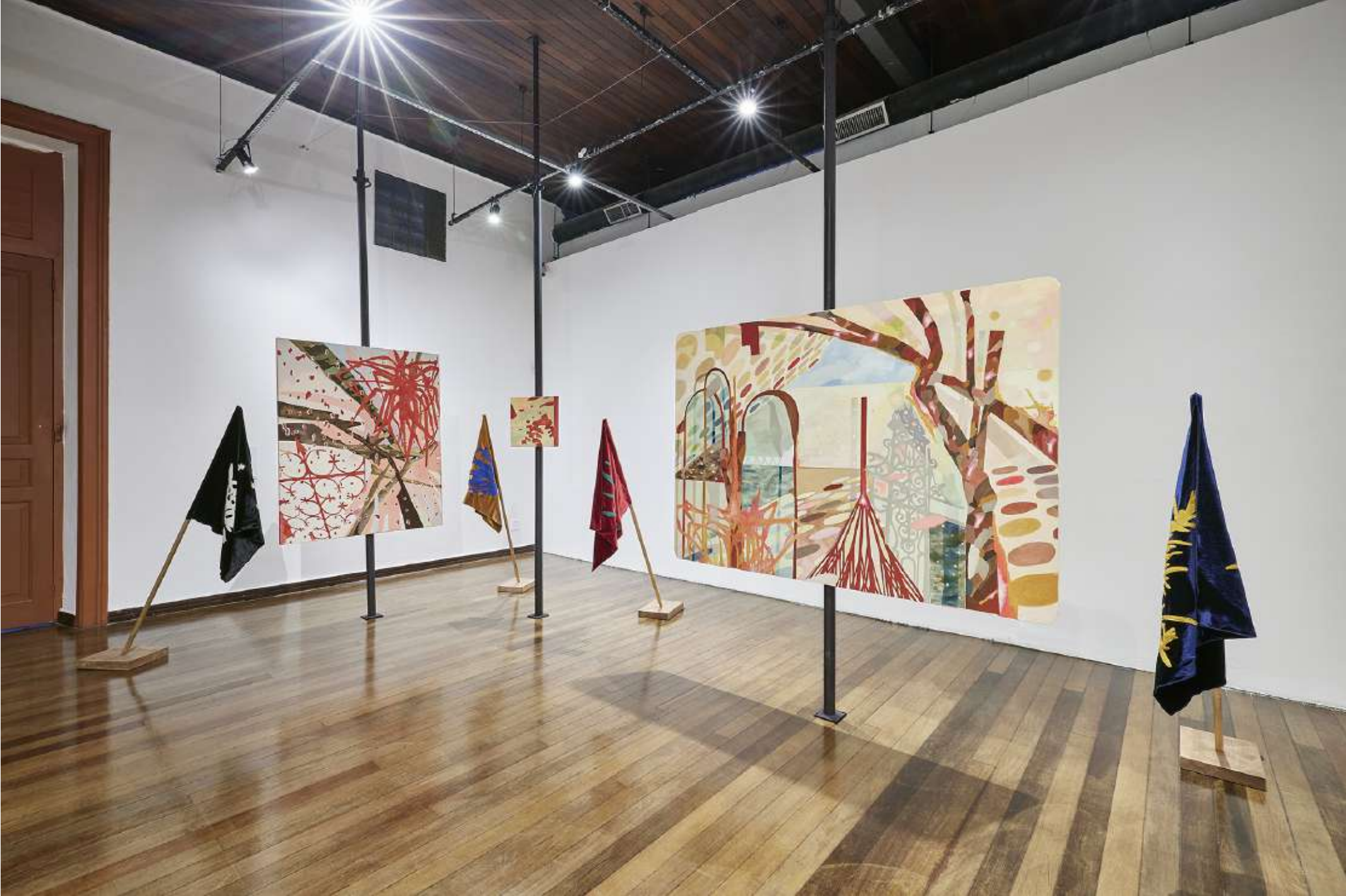
Solo show view: Space Between 2024 Sep - Centro Cultural dos Correios. Rio de Janeiro RJ, Brazil.