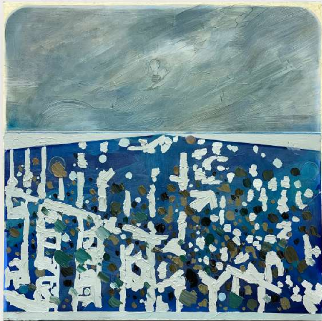
Metalandscape number XXXVI, 2026. Oil on canvas. 23"x23"