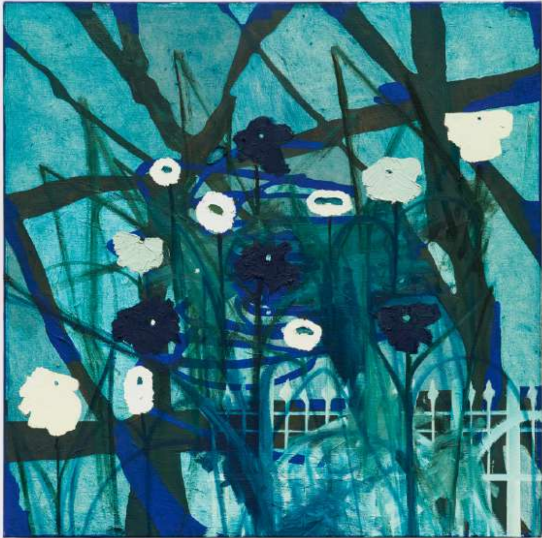
Metalandscape number XXXIV, 2025. Oil on canvas. 23"x23"