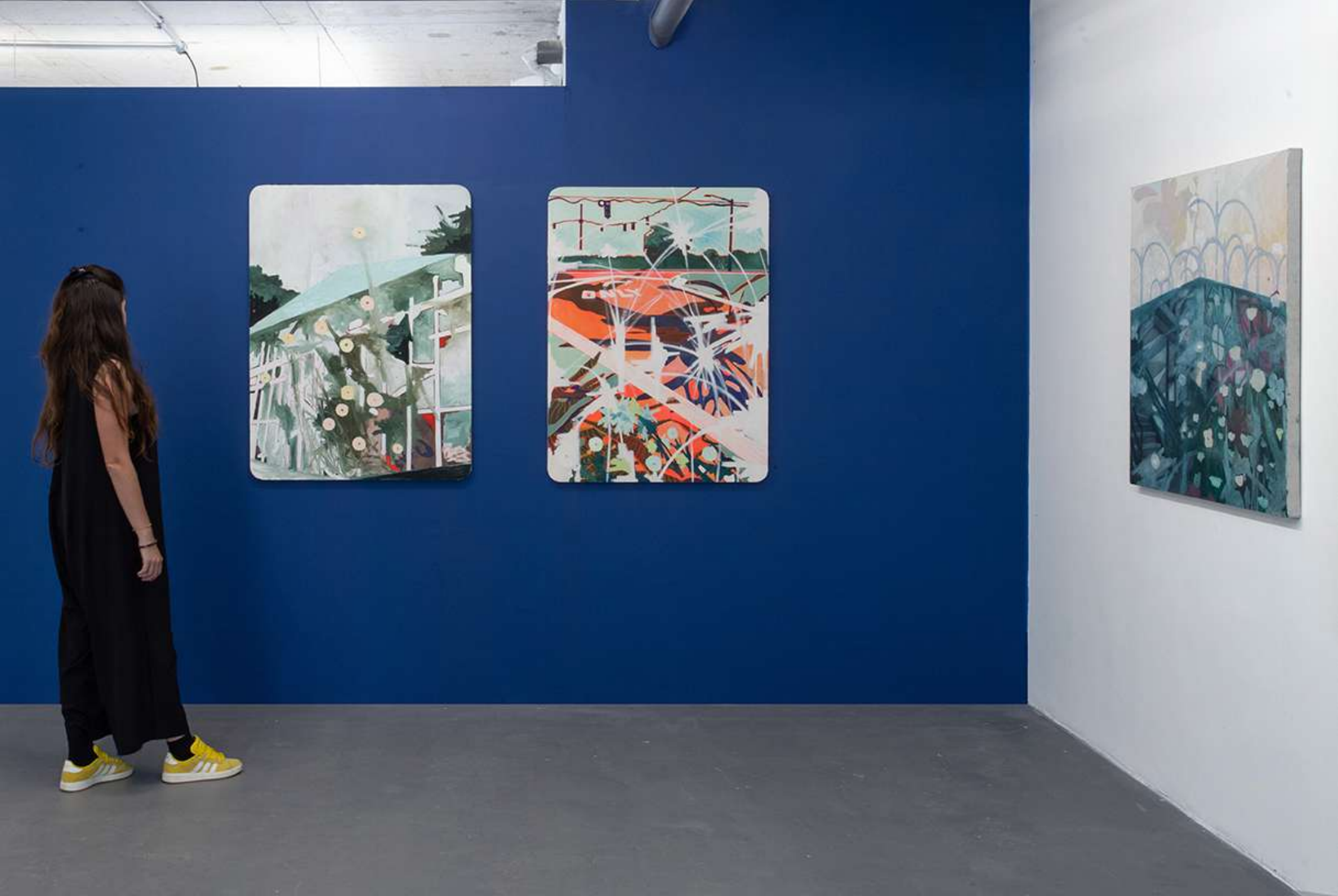
Solo show view - Space Between : Part II. 2026 Apr - OMA Galeria. São Paulo - SP, Brazil.