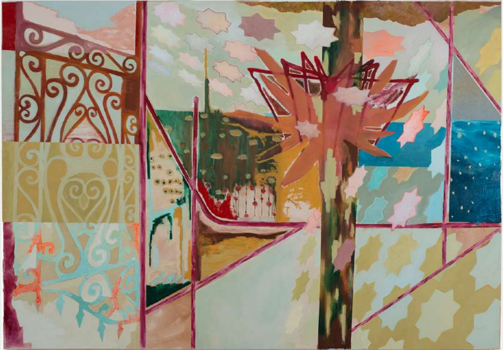
Metalandscape number XVI, 2024. Oil on canvas. 55"x78"