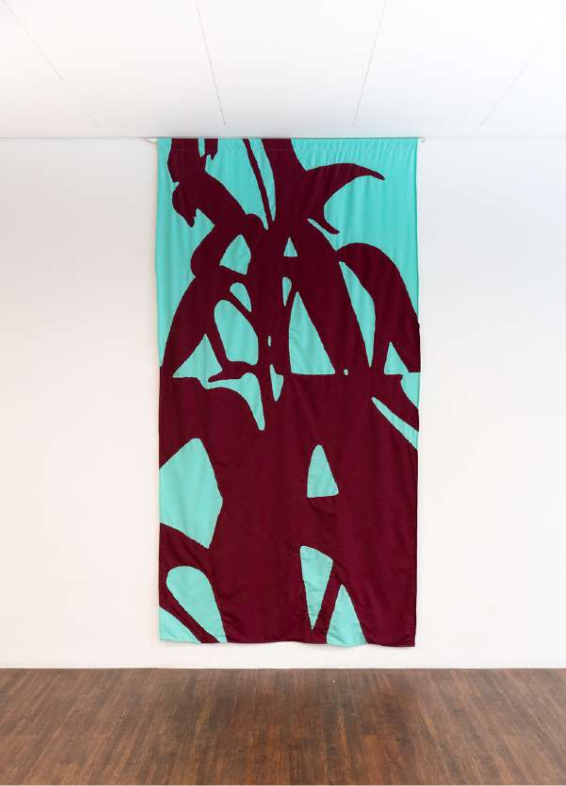
In n out III, 2023 Flag, 62x102"