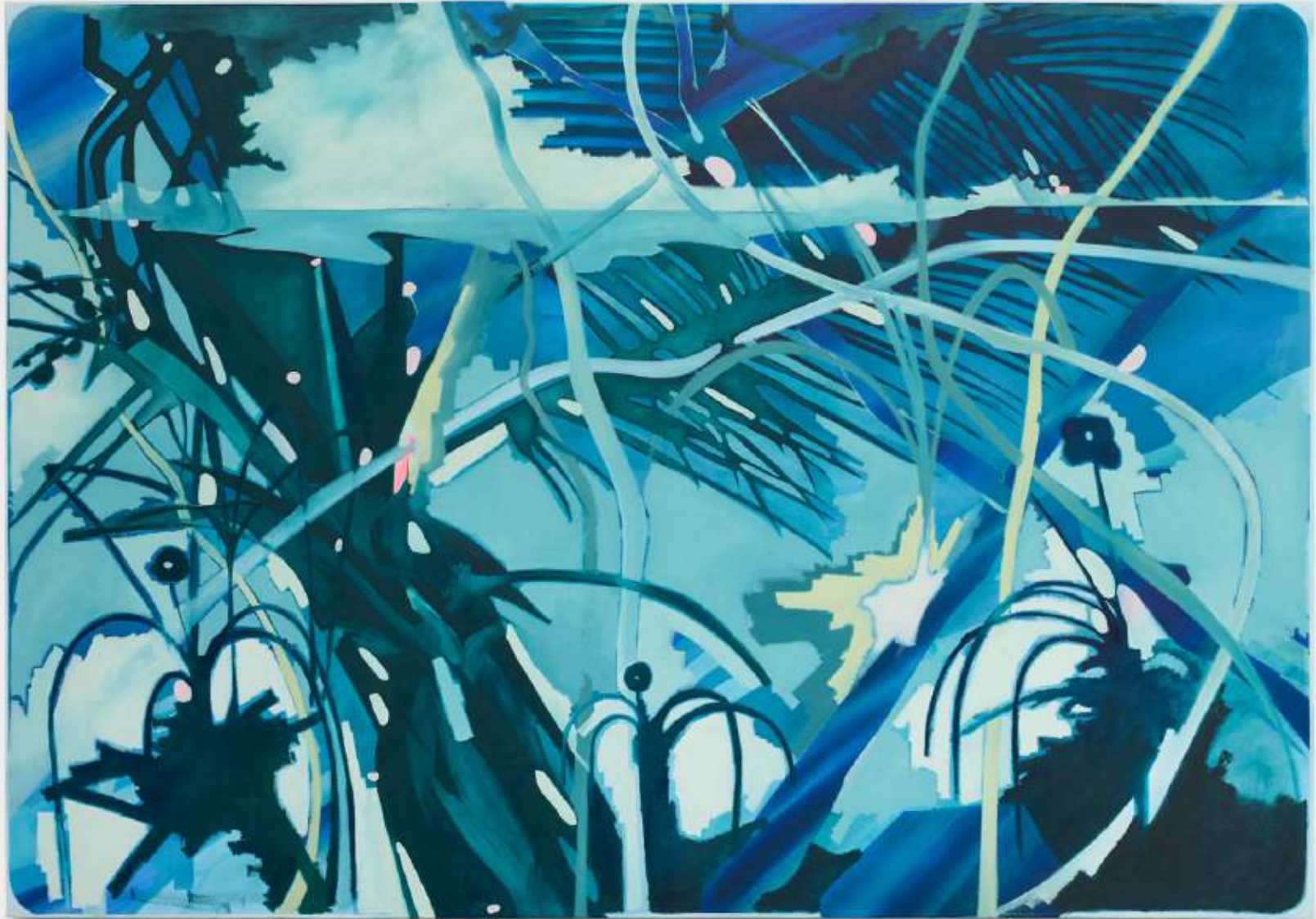
Metalandscape number II, 2023 - 2025 Oil on canvas. 55"x78"