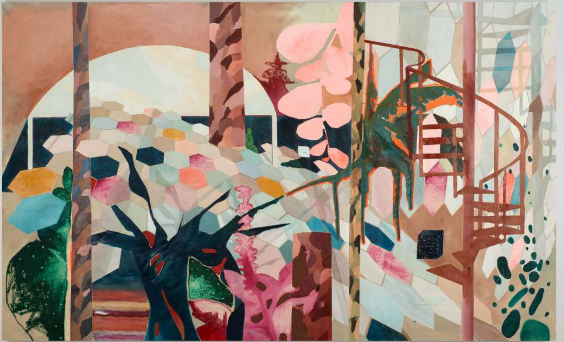
Metalandscape number XV, 2024. Oil on canvas. 62"x102"