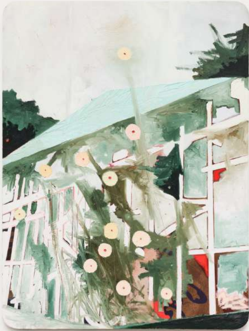
Metalandscape number XXX, 2022 - 2025. Oil on canvas. 47"x35"