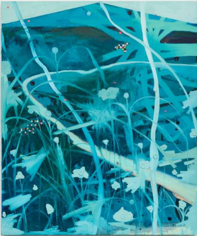
Metalandscape number XXXII, 2019 - 2025. Oil on canvas. 47"x39"