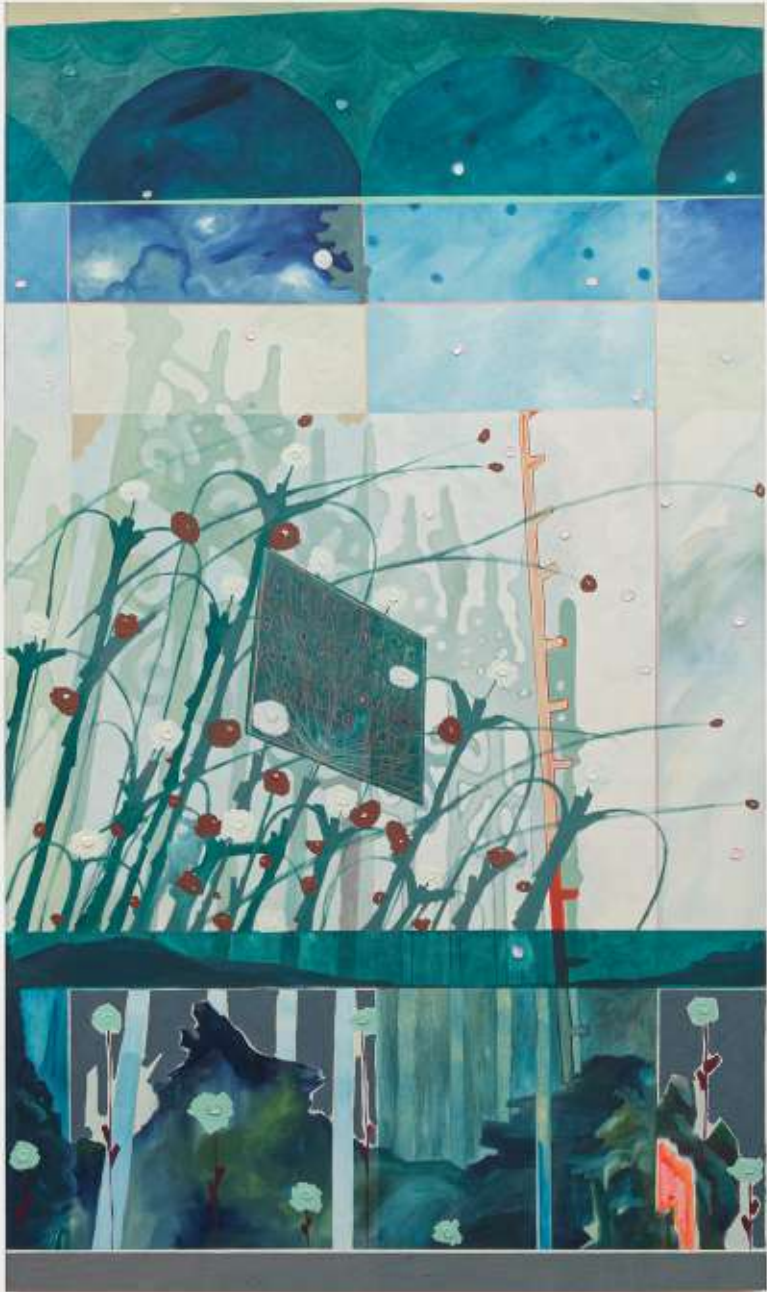
Metalandscape number XXIV, 2025. Oil on canvas. 71"x36"