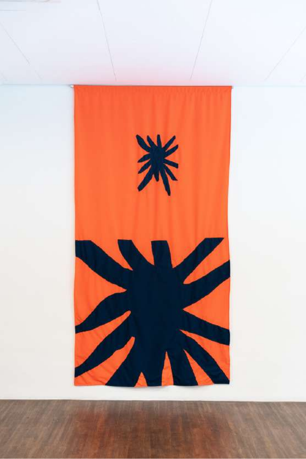
In n out IV, 2023 Flag. 62x102"