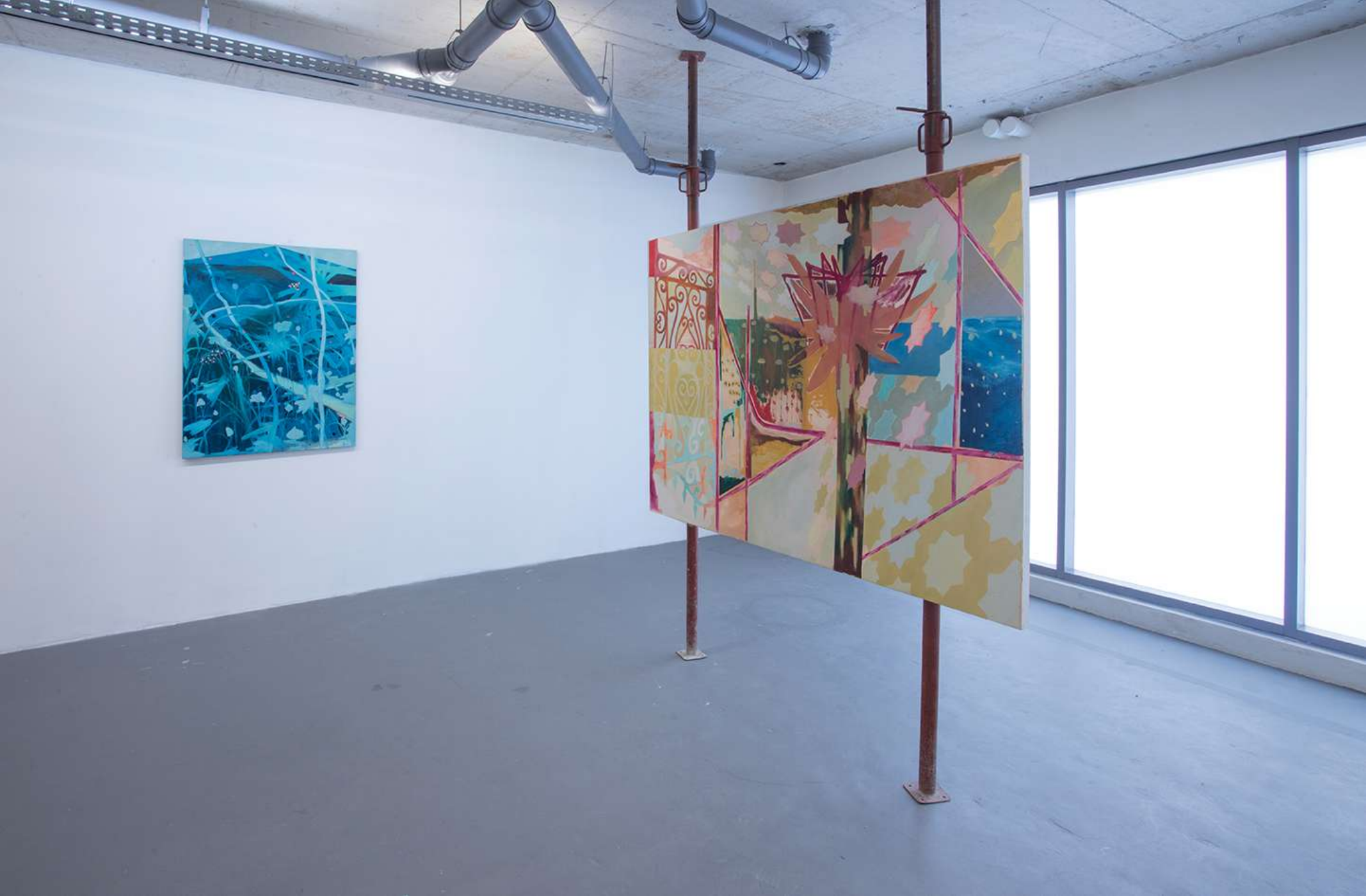
Solo show view - Space Between : Part II. 2026 Apr - OMA Galeria. São Paulo - SP, Brazil.