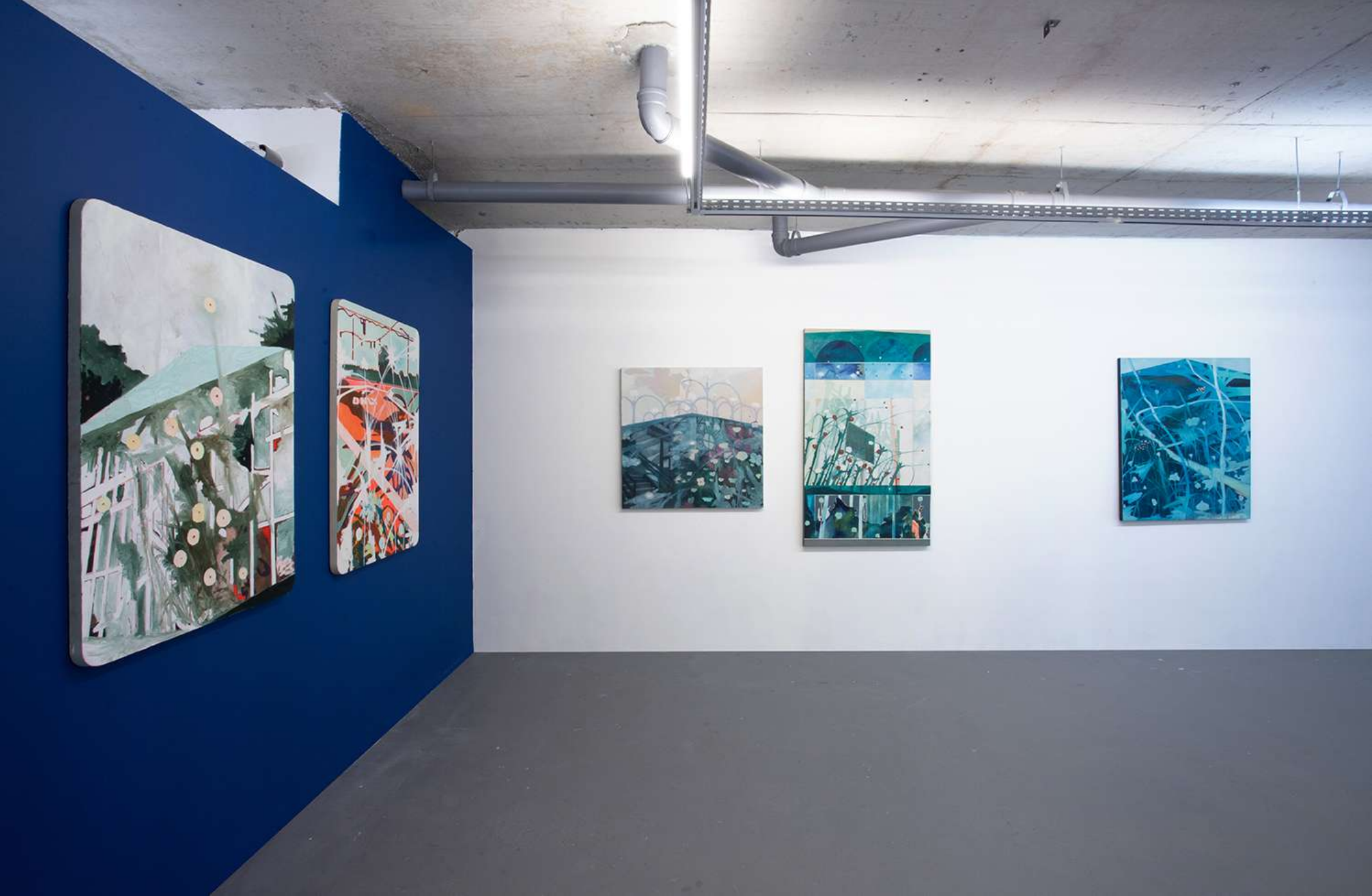
Solo show view - Space Between : Part II. 2026 Apr - OMA Galeria. São Paulo - SP, Brazil.