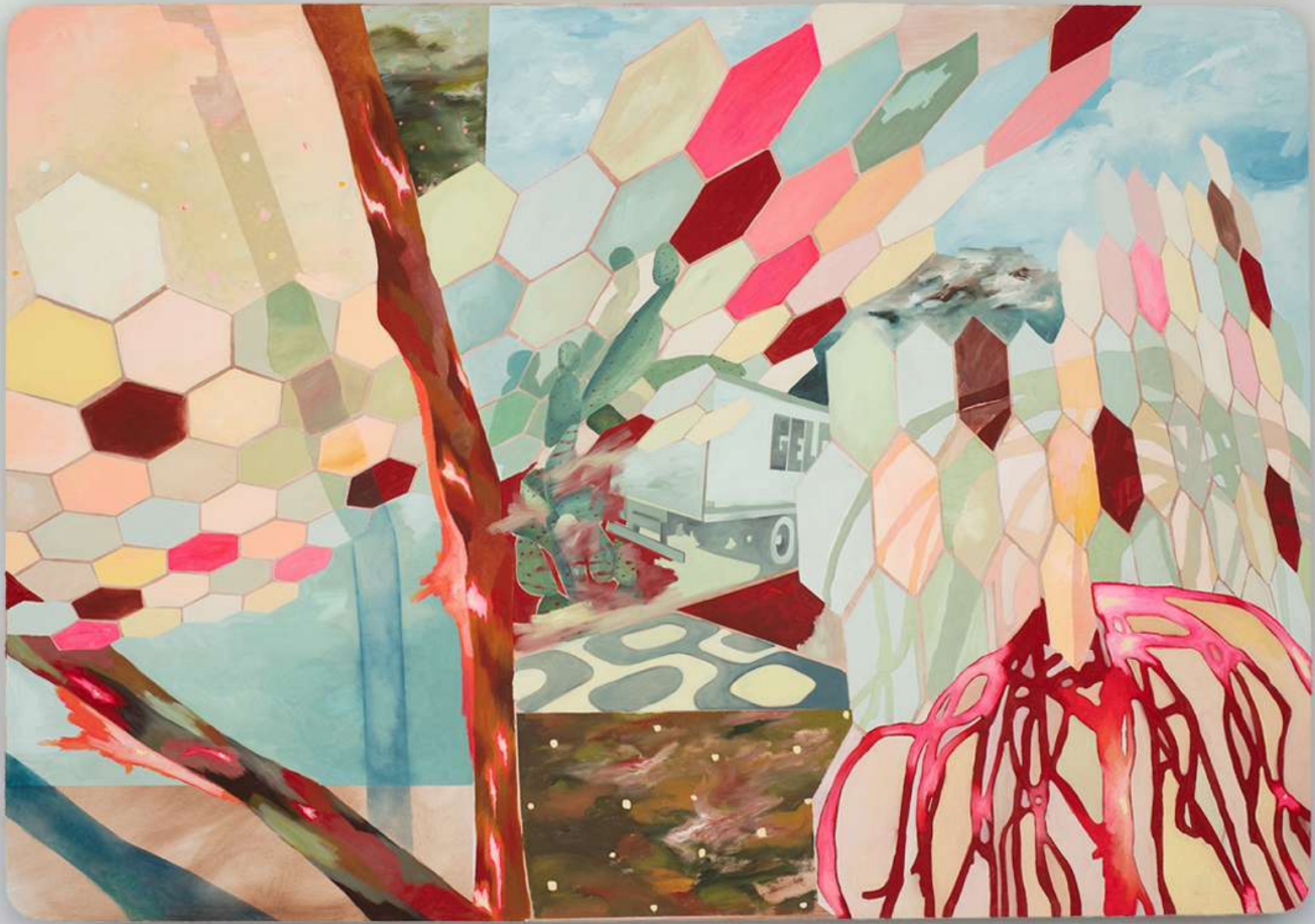
Metalandscape number XVIII, 2024. Oil on canvas. 55"x78"